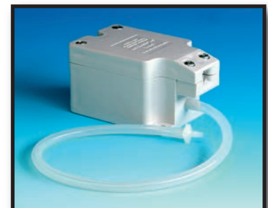
AW-14 : AW-10 Switch in a Molded Enclosure

NEMA Rating: 4x Enclosure Material: Polycarbonate Tubing: Silicone, 1 Ft. x 3/32" I.D. Pneumatic Connection: Barbed Coupler 3/32" I.D.