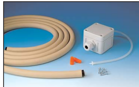
Air-Wave Kit featuring an AW-12 Switch and components (optional coil cord not shown)