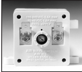
AW10 Air-Wave Switch

The AW10 switch is the same switch used in the AW12 and AW14 models.